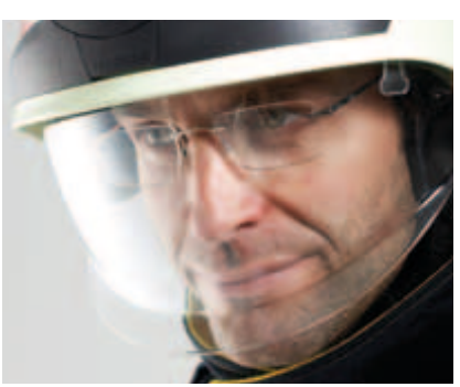
Extensive facial protection

Both visors are also suitable for wearers of spectacles