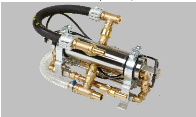
FC - proportioning with the direct-injection foam proportioning