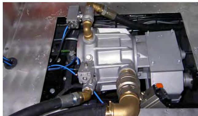
Midships-mounted in AT truck