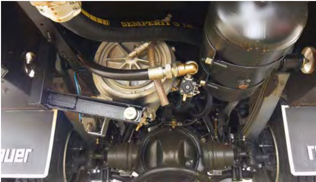
Underfloor installation: more compartment space for additional