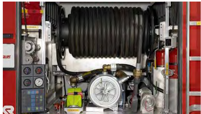
Compact installation as rear-mount version